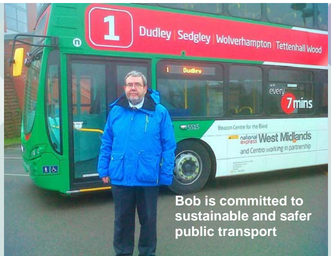
Bob is committed to sustainable and safer public transport

Online reports from West Midlands Police Authority are available in the "Governance" section of the Commissioner's website.