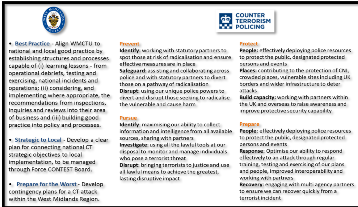
Figure 1 - WMCTU Business Plan

26. The WMCTU 2018/19 Business Plan set out the WMCTU response to three Regional strategic priorities and 12 National strategic priorities.