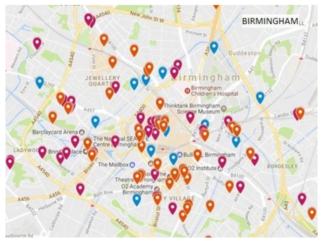
Figure 1 - Birmingham City Council Area