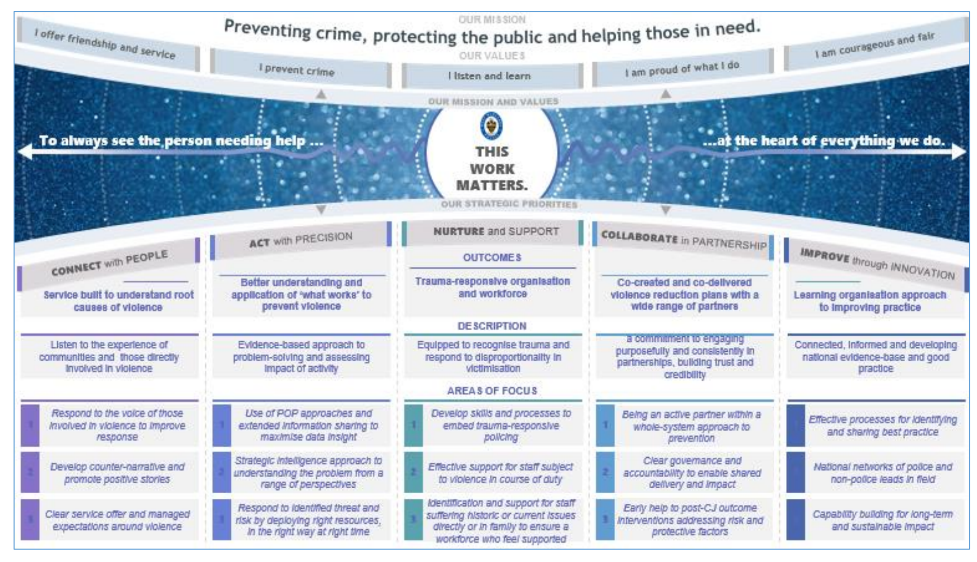
Figure 2: WMP Violence Strategy 2020/21